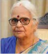
Smt. Mridula Sinha Governor of Goa